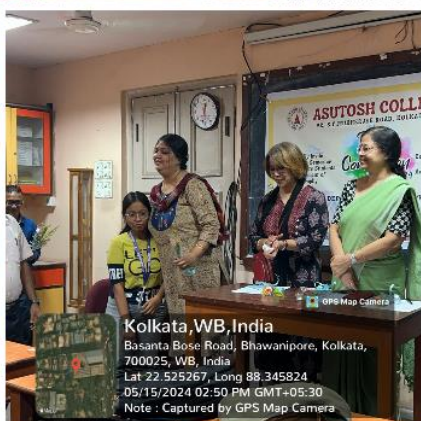
Kolkata, WB, India Basanta Bose Road, Bhawanipore, Kolkata, 700025, WB, India Lat 22.525267, Long 88.345824 05/15/2024 02:50 PM GMT+05:30 Note : Captured by GPS Map Camera