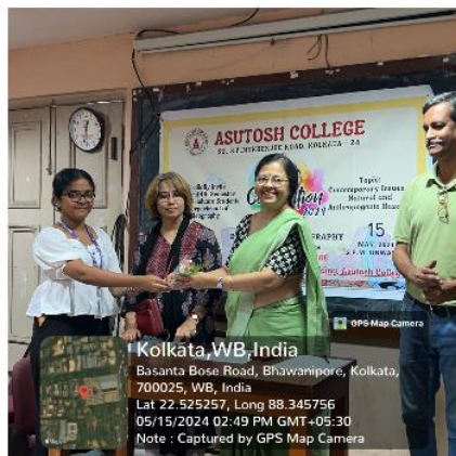
Kolkata, WB, India Basanta Bose Road, Bhawanipore, Kolkata, 700025, WB, India Lat 22.525257, Long 88.345756 05/15/2024 02:49 PM GMT+05:30