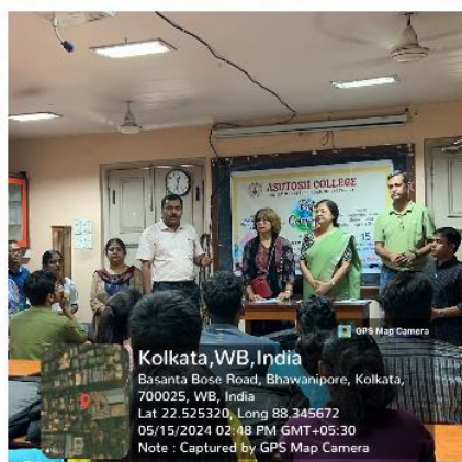
Kolkata, WB, India Basanta Bose Road, Bhawanipore, Kolkata, 700025, WB, India Lat 22.525320, Long 88.345672 05/15/2024 02:48 PM GMT+05:30 Note : Captured by GPS Map Camera