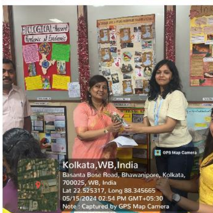
Kolkata, WB, India Basanta Bose Road, Bhawanipore, Kolkata, 700025, WB, India Lat 22.525317, Long 88.345665 05/15/2024 02:54 PM GMT+05:30